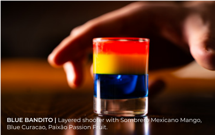
BLUE BANDITO | Layered shooter with Sombrero Mexicano Mango, Blue Curacao, Paixão Passion Fruit.

A full-bodied, silky smooth cream liqueur made with delicious, mouthwatering passion fruit, alongside a warming dose of the finest tequila.