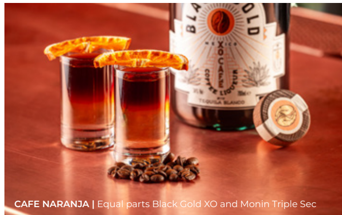
CAFE NARANJA | Equal parts Black Gold XO and Monin Triple Sec