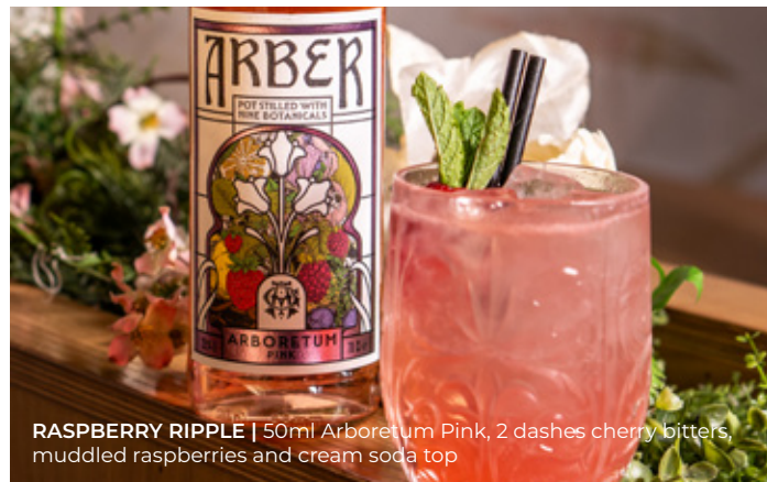
RASPBERRY RIPPLE | 50ml Arboretum Pink, 2 dashes cherry bitters, muddled raspberries and cream soda top