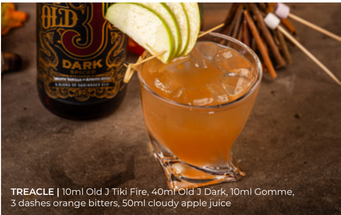
TREACLE | 10ml Old J Tiki Fire, 40ml Old J Dark, 10ml Gomme, 3 dashes orange bitters, 50ml cloudy apple juice

The world's first 151 overproof spiced rum.