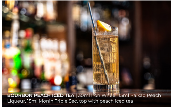
BOURBON PEACH ICED TEA | 30ml Iron Wheel, 15ml Paixão Peach Liqueur, 15ml Monin Triple Sec, top with peach iced tea