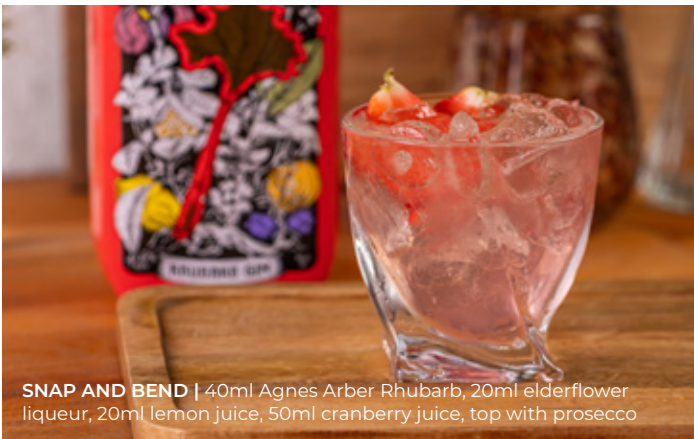
SNAP AND BEND | 40ml Agnes Arber Rhubarb, 20ml elderflower liqueur, 20ml lemon juice, 50ml cranberry juice, top with prosecco

The flavours of pineapple and mango are added to original Agnes Arber Premium Gin, post-distillation. A rich and totally tropical gin with freshly cut pineapple and a hint of mango on the nose.