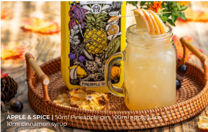
APPLE & SPICE | 50ml Pineapple gin, 100ml apple juice, 10ml cinnamon syrup