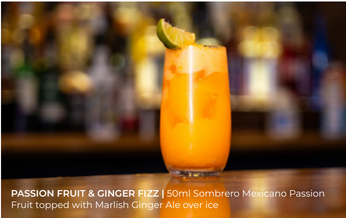
PASSION FRUIT & GINGER FIZZ | 50ml Sombrero Mexicano Passion Fruit topped with Marlish Ginger Ale over ice