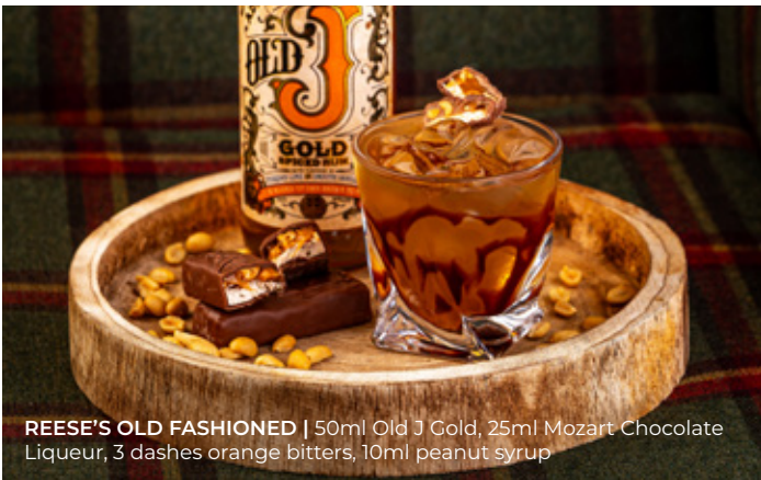
REESE'S OLD FASHIONED | 50ml Old J Gold, 25ml Mozart Chocolate Liqueur, 3 dashes orange bitters, 10ml peanut syrup