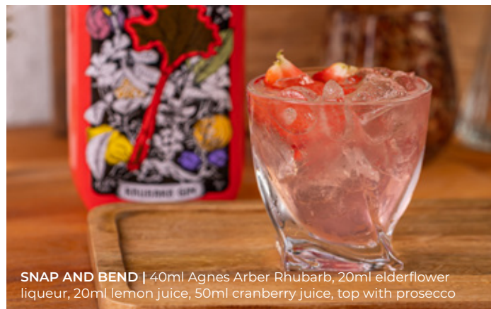
SNAP AND BEND | 40ml Agnes Arber Rhubarb, 20ml elderflower liqueur, 20ml lemon juice, 50ml cranberry juice, top with prosecco

A convergence of the same nine pot still botanicals Agnes Arber Gin is famed for but softened for a lighter experience. At 37.5% Arboretum is a gin for everyone. Juniper forward, refreshing, and crisp. Perfect as a house pour, or cocktail base, Arboretum is a gin offering for those that have fallen in love with the original Arber range but are looking for a more accessible alternative.