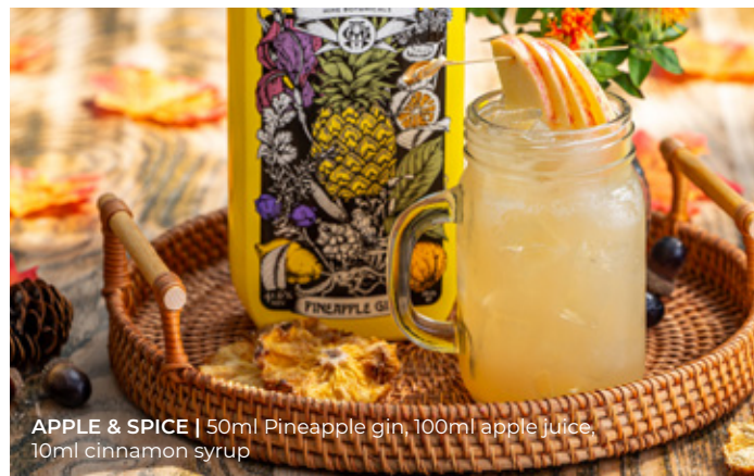
APPLE & SPICE | 50ml Pineapple gin, 100ml apple juice, 10ml cinnamon syrup