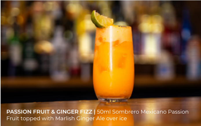
PASSION FRUIT & GINGER FIZZ | 50ml Sombrero Mexicano Passion Fruit topped with Marlish Ginger Ale over ice