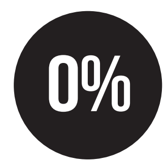
Sugar free and no artificial preservatives

We are committed to sustainability; onsite solar energy generation and an ever growing tree planting program allow us to utilise renewable energy for the production of our range. Our canned drinks are sugar free, low calorie and free from artificial preservatives.